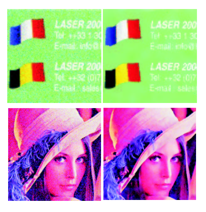
Figure 2. Spatial-tonal normalized convolution. On the left images corrupted with noise and on the right the result of the STN convolution.

much better preserved compared with the classical (spatial) Gaussian convolution. The spatial scale is of little influence on these properties.