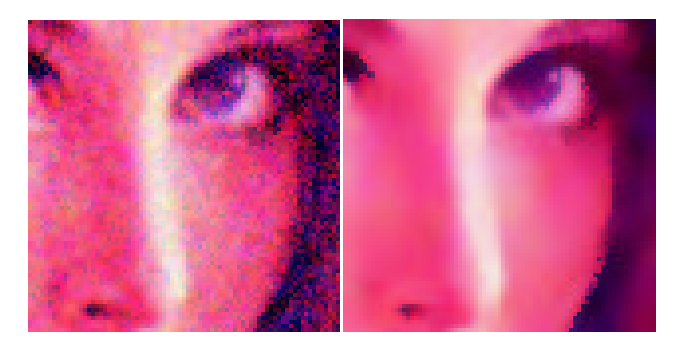
Figure 3. Iterating the spatial-tonal normalized convolution. On the left images corrupted with noise and on the right the result of the iterated STN convolution (i.e. finding the local mode, i.e. robust estimation of the zero order image structure).

leads to an expression for the STN convolution that is valid for color images as well. In fact all examples shown in the paper are color images.